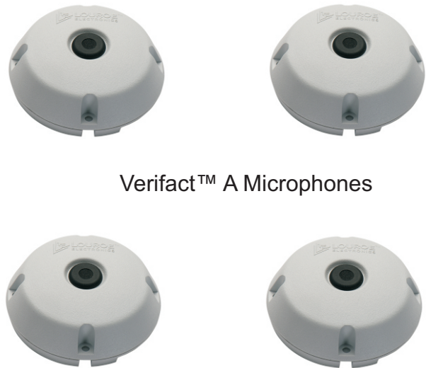
Verifact™ A Microphones