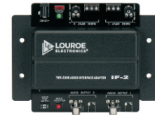
IF-2 AUDIO INTERFACE ADAPTER (two audio inputs and outputs)

These three units also contain individual "audio level control" potentiometers for audio gain adjustment. Output from the Louroe microphone can be increased 10dB or decreased -30dB.