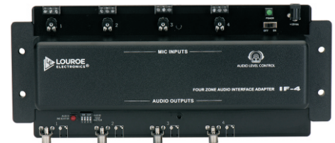
IF-4 AUDIO INTERFACE ADAPTER (four audio inputs and outputs)