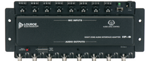
IF-8 AUDIO INTERFACE ADAPTER (eight audio inputs and outputs)