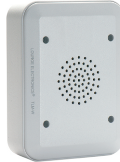
MODEL TLM-W SPEAKER/MICROPHONE Flush or Surface Mount (Flush mounting requires a 3 gang box)

Models TLM-W is a two-way speaker/microphone with an electret condenser microphone and 2.5" speaker, all within one housing. As part of a Louroe audio system, It provides two-way communication between the remote area and the audio receiving device (Louroe Base Station, etc). Provided with the unit is a plastic back box for surface mounting to a wall.